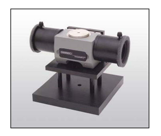
Figure 1. ConcentratIR2 Multiple Reflection Accessory